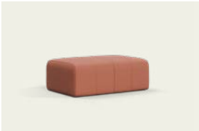
OTTOMAN 2-SEATER STRAIGHT

JON-OTT-1SST O/A: 470 X 720 X 870 MM SEAT: 470 X 610 MM