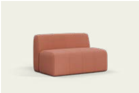
STANDARD BACK 2-SEATER STRAIGHT

JON-SB-1SST O/A: 795 X 720 X 870 MM SEAT: 470 X 610 MM