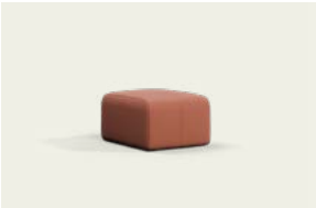
OTTOMAN 1-SEATER STRAIGHT

JON-OTT-1SST O/A: 470 X 720 X 870 MM SEAT: 470 X 610 MM