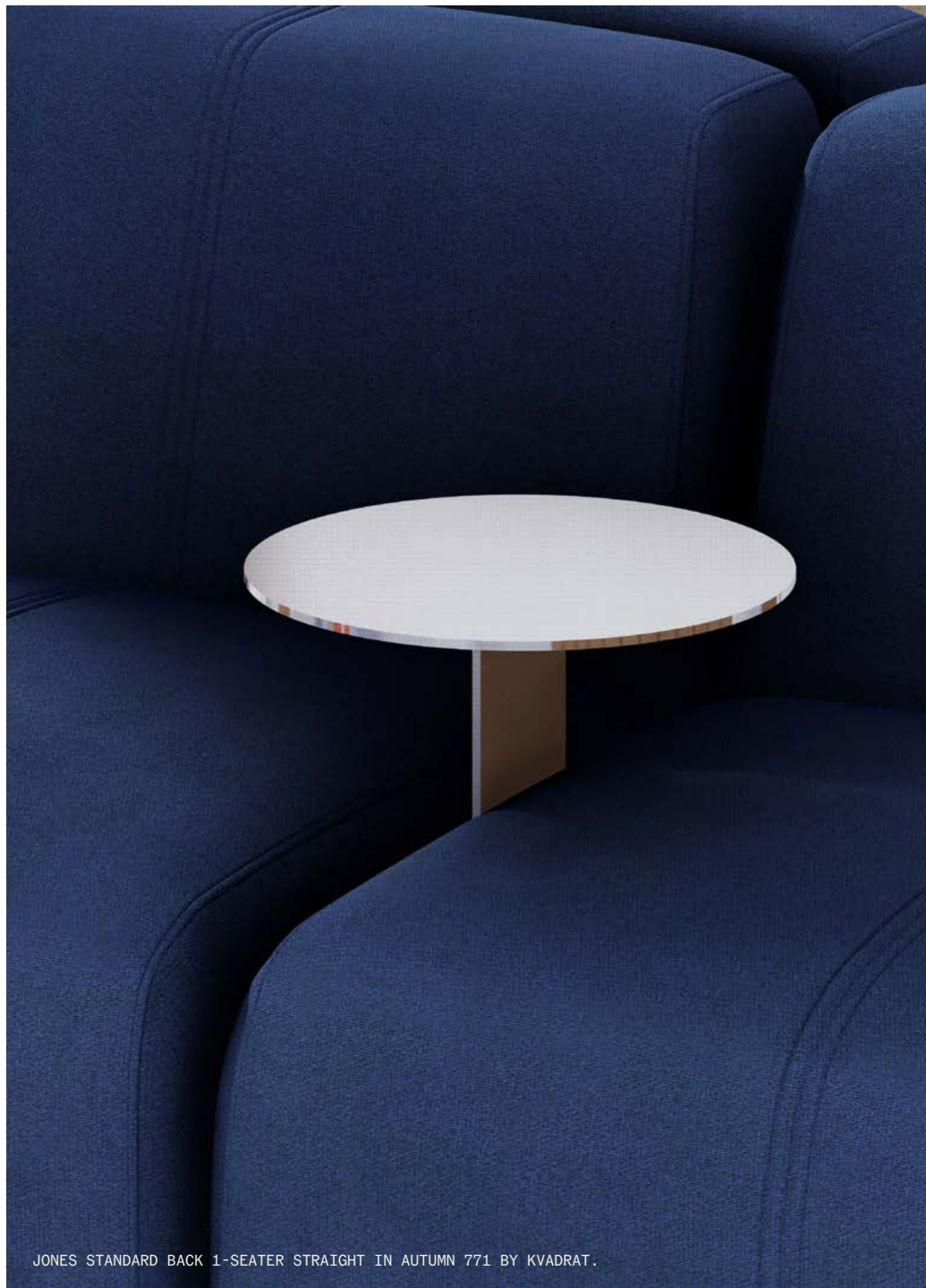
JONES STANDARD BACK 1-SEATER STRAIGHT IN AUTUMN 771 BY KVADRAT.