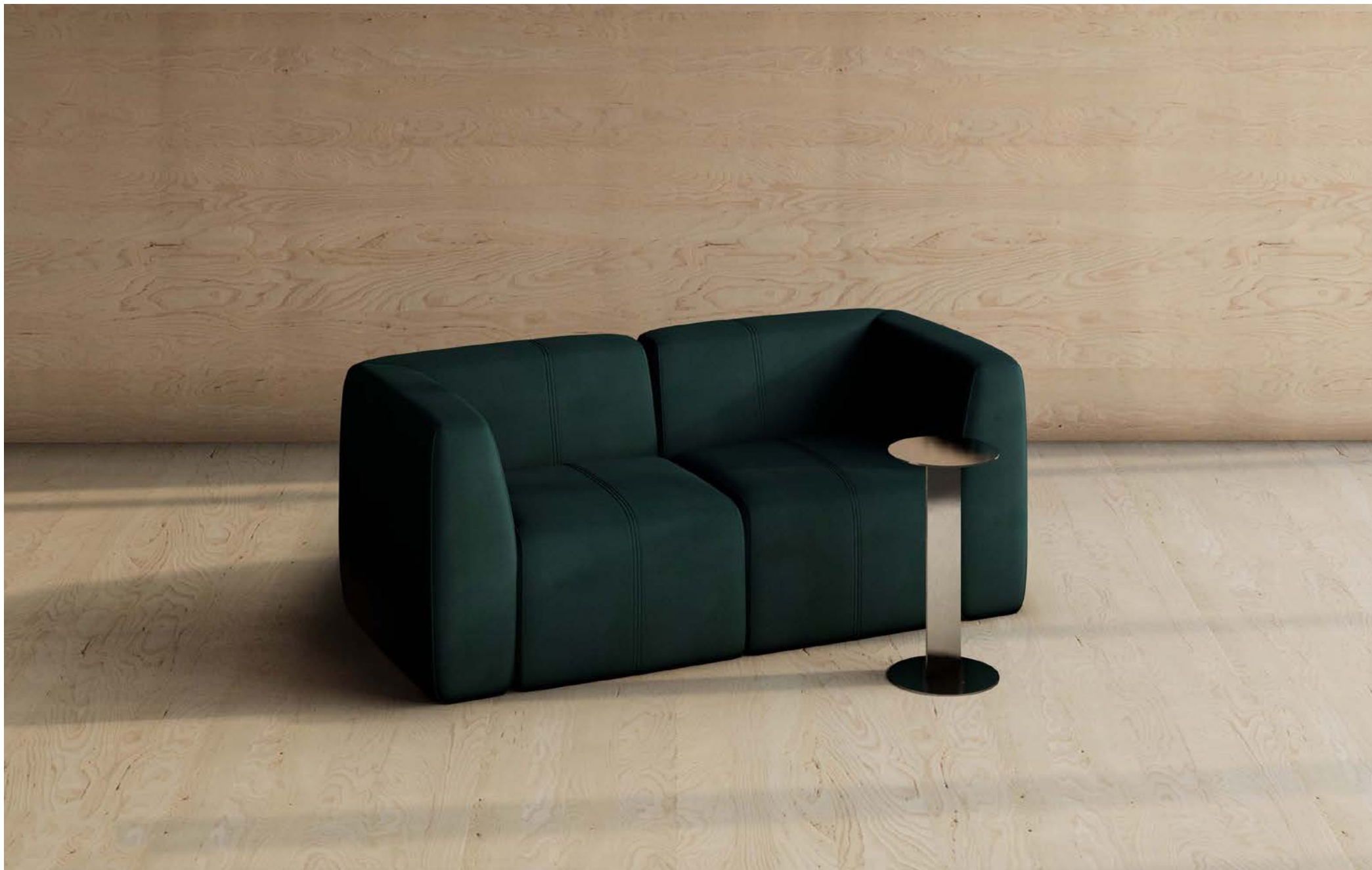
JONES STANDARD BACK CORNER LEFT + CORNER RIGHT IN AUTUMN 971 BY KVADRAT.