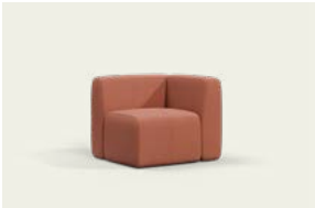
STANDARD BACK 90° 1-SEATER CORNER -RHS JON-SB-1S-CNR O/A: 795 X 870 X 870 MM SEAT:470 X 610 MM