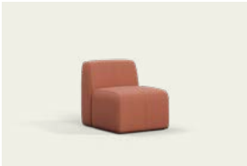
STANDARD BACK 1-SEATER STRAIGHT

JON-SB-1SST O/A: 795 X 720 X 870 MM SEAT: 470 X 610 MM