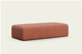
OTTOMAN 3-SEATER STRAIGHT

JON-OTT-2SST O/A: 470 X 1320 X 870 MM SEAT: 470 X 610 MM