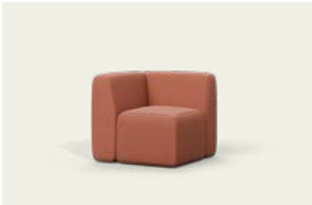
STANDARD BACK 90° 1-SEATER CORNER JON-SB-1S-CNR O/A: 795 X 870 X 870 MM SEAT:470 X 610 MM