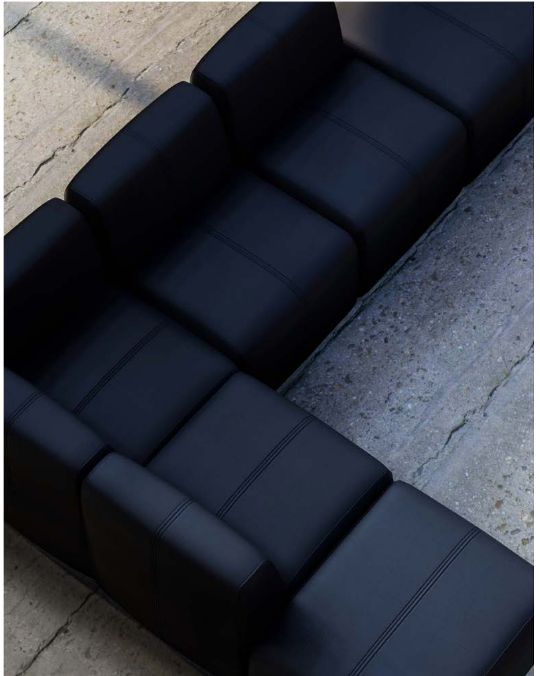
JONES STANDARD BACK 1-SEATER STRAIGHT + OTTOMAN 1-SEATER IN SENSO LEATHER GOTHAM BY DECOR DESIGN CENTRE.