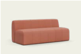
STANDARD BACK 3-SEATER STRAIGHT

JON-SB-2SST O/A: 795 X 1320 X 870 MM SEAT: 470 X 610 MM