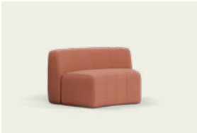
STANDARD BACK 45° CONCAVE

JON-SB-3SST O/A: 795 X 1920 X 870 MM SEAT: 470 X 610 MM