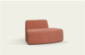
STANDARD BACK 45° CONVEX

JON-SB-45CAV O/A: 795 X 870/1475 X 870 MM SEAT: 470 X 610 MM