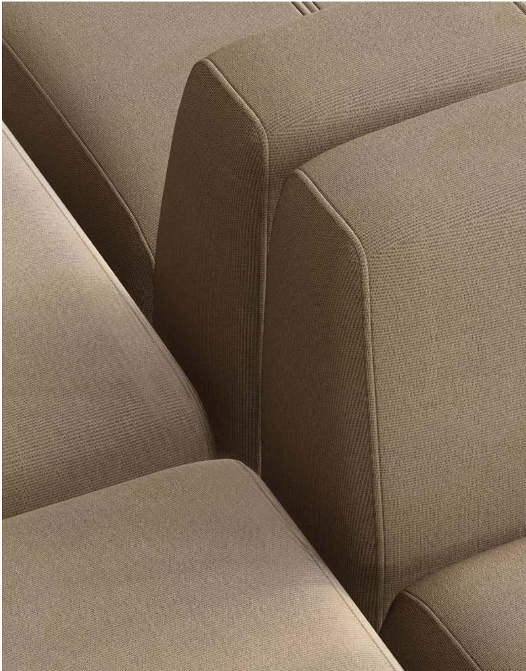
JONES STANDARD BACK 1-SEATER STRAIGHT + OTTOMAN SQUARE IN AUTUMN 221 BY KVADRAT.