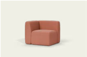
STANDARD BACK 90° 1-SEATER CORNER -LHS JON-SB-1S-CNR O/A: 795 X 870 X 870 MM SEAT:470 X 610 MM

JON-SB-45CVX O/A: 795 X 1475/870 X 870 MM SEAT:470 X 610 MM